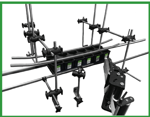
SIDE RAILS & TOP TRAP